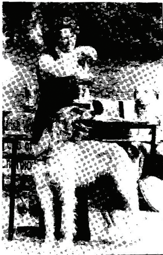
Tolkavalley Sceoling winning Green Star Bitch and Reserve Best in Show at the 1977 Club Show.