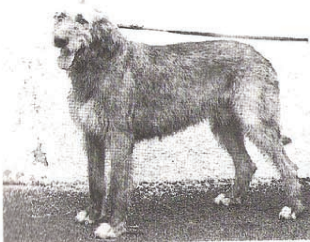
Finbar of Ballytobin