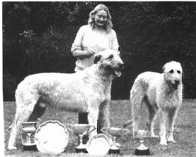
Irish/Nordic Ch. Ballykelly Reamonn

Int (Irish/Nordic) Ch Ballykelly Reamonn, 1970, (Ch Holmehill Torridan x Ch Ballykelly Molly Mulligan) having won Best in Show at Sporting Breeds and Reserve BIS at Irish Breeds while still a yearling, continued his successful career in Norway.