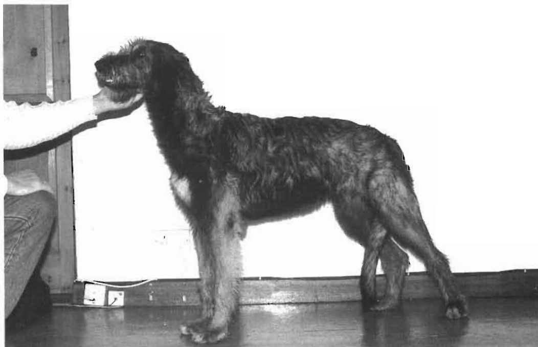
GULLIAGH NADIA (At 6 Months)

Nadia's sire is Ch & UK Ch Culvercroft Benjamin of Gulliagh, the breed record holder of the greatest number of championship certificates (Green Stars/Challenge Certificates). Her dam is Ch. Gulliagh Isolde, top-winning IW bitch in Ireland 1990.