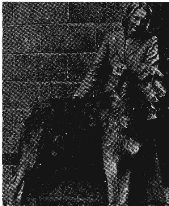
Irish / UK Ch. Artel Ballykelly Sandy