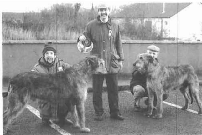
Best Bitch Dutchess of Nutstown – Athcarne Oisín BOB.