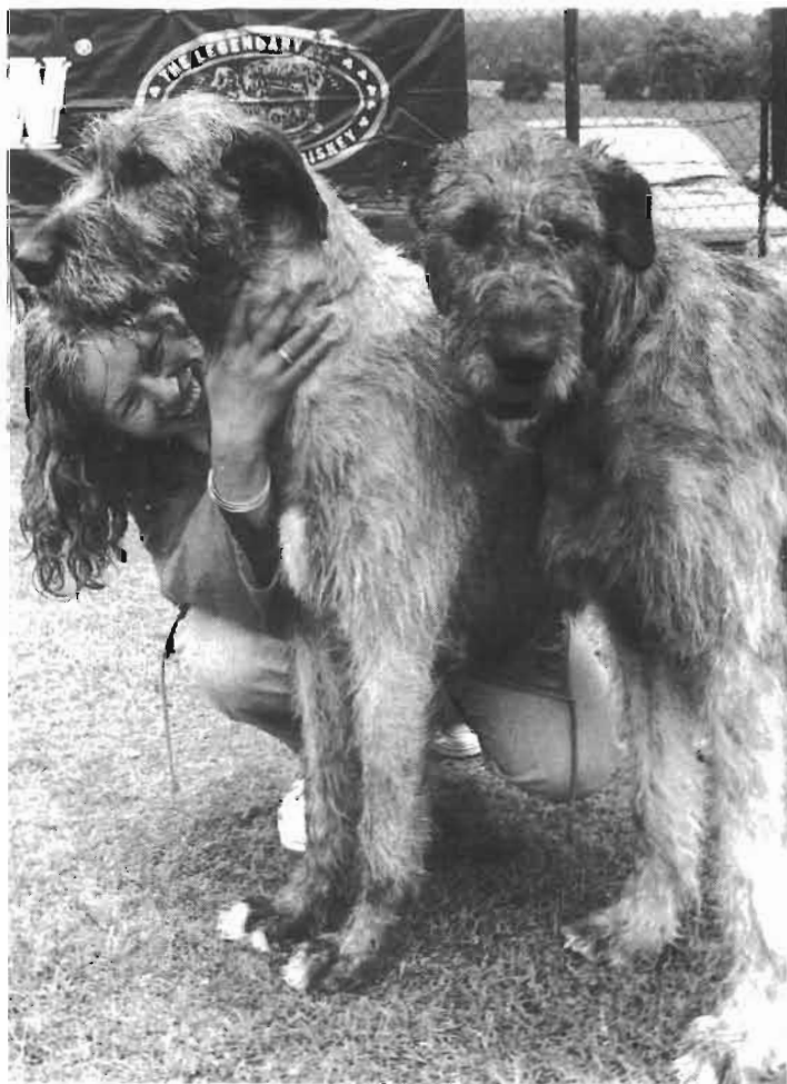
Best Brace — Knocknarea Eoin y Eilis