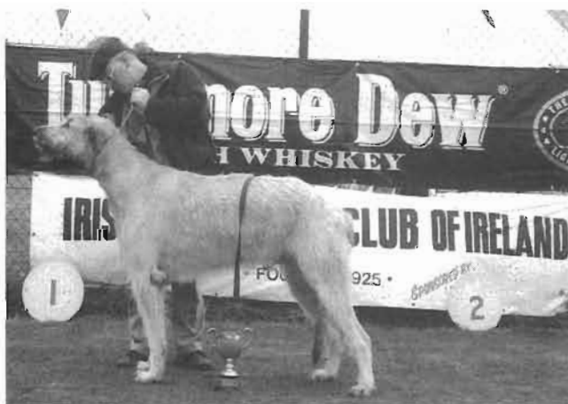
Tallest Dog – Owen's Own.