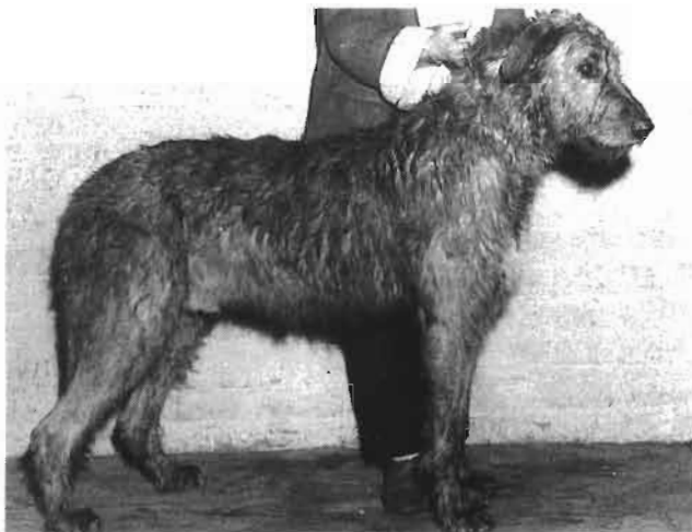
IR/UK Ch. McGilligan of Ballykelly