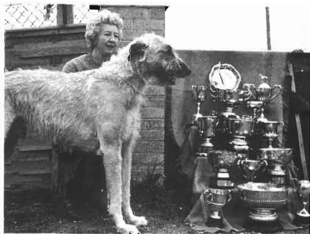
Cu admiring the trophies he won in 1970.