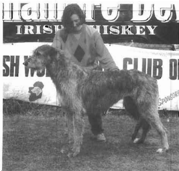
Best Movement — Maruinae Flaminia of Blakeskena