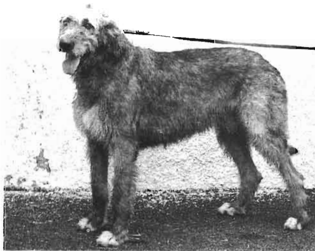
Finbar of Ballytobin