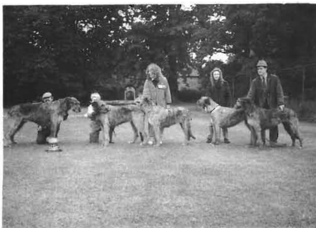
Knocknarea Briciu – Best Stud Dog