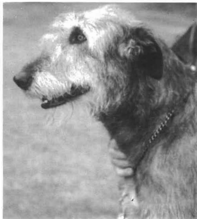
Best Head – Duchess of Nutstown