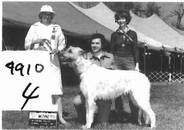
US. Ch. Ballykelly Banshee 9/70