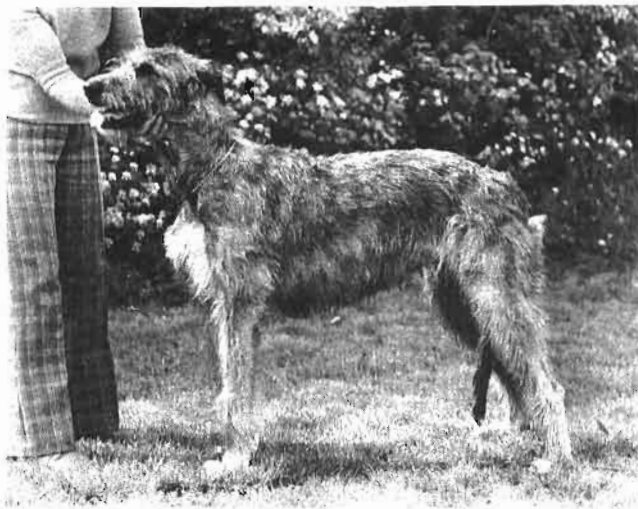
Eimar of Knocknaros

Cu's sister Maeve Regina was bred to Aron of Nendrum in 1971. This litter produced Eileen, Eimear and Fionlan of Knocknaros, hounds still present behind some Irish lines.