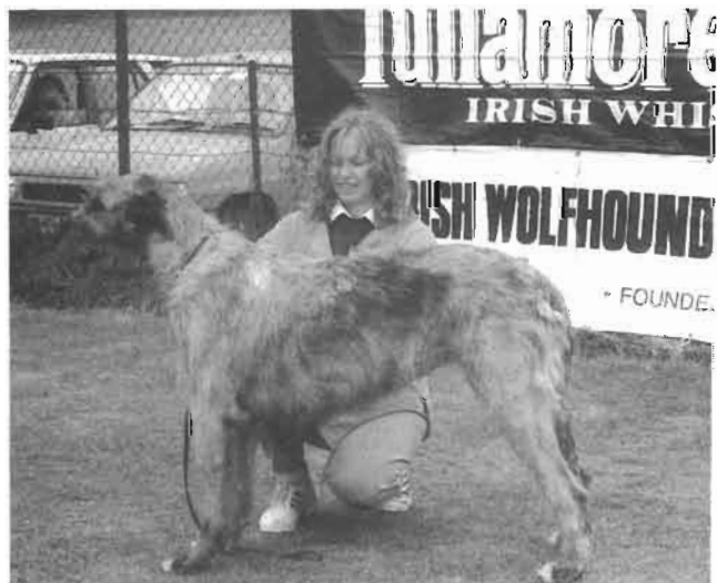
Tallest and Most Sound Bitch Knocknarea Eilish.