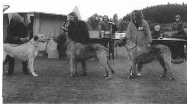
Knocknarea Cinn Oir – Best Brood Bitch