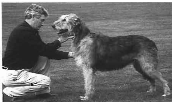
Haley of Bearna Bui

(Ch Culvercroft Benjamin of Gullagh x Carrokeel Elvin of Bearna Bui)