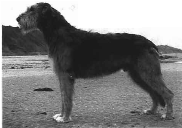
Ch/UK Ch Culvercroft Benjamin of Gulliagh Annual Ch 1988, 1989, 1990. (October 1985 to October 1994)