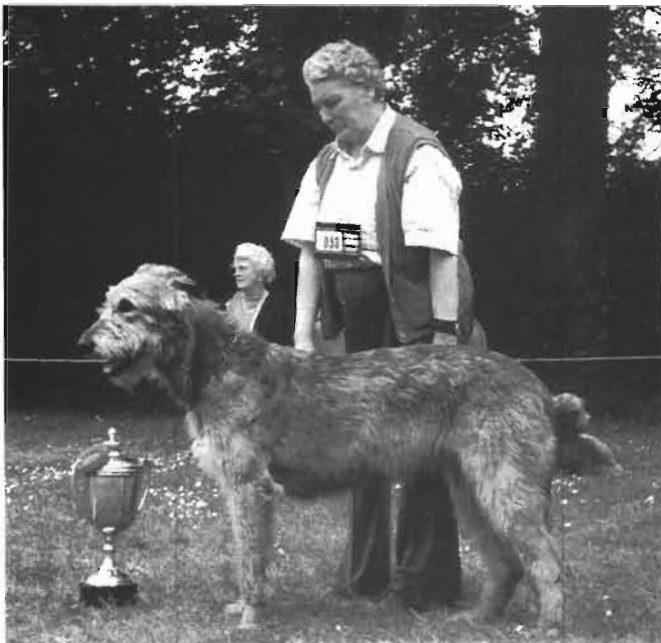
Veteran Bitch: Walton's TOLKAVALLEY BARNA