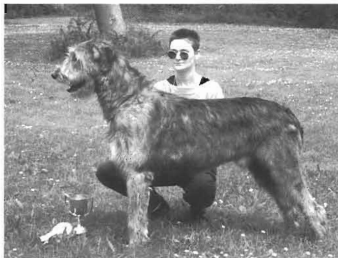
Graduate Dog. FREDDIE OF NUTSTOWN

1. Crawshaw's Bleddyn Blewog O Caredig . Typical good hound shape with good shoulders and good bone. Nice depth of chest, ample spring of rib and sweep to hindquarters. Lacked any drive on the move from the rear. Res. Green Star.