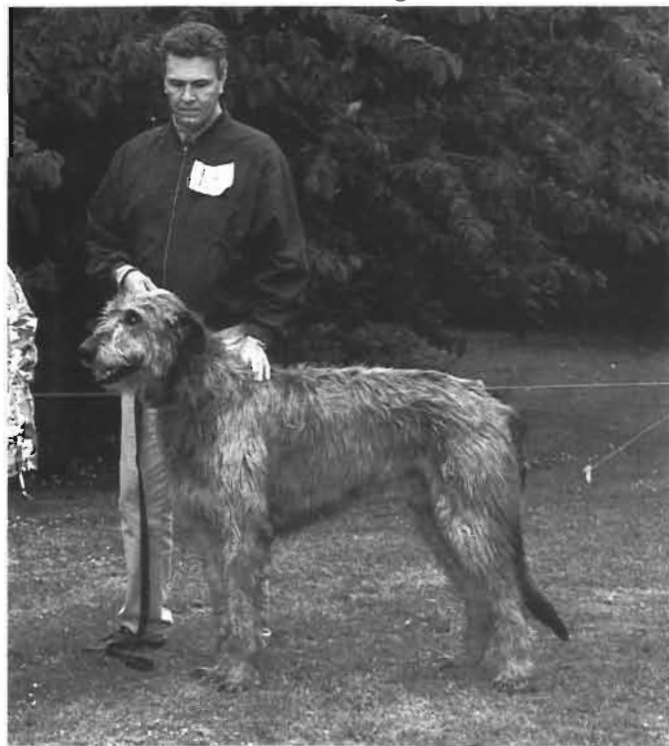
THE LORD OF NUTSTOWN - Tallest Dog