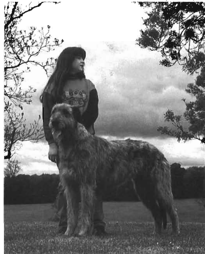
BOB Clonmel - BLOSSOM OF NUTSTOWN

The Ballyvalla Tray: Fitzpatrick-Odahamier's Owenmore Merlin .