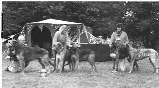
Best Stud Dog: CH EDEYRN HENRI OF KILLYKEEN