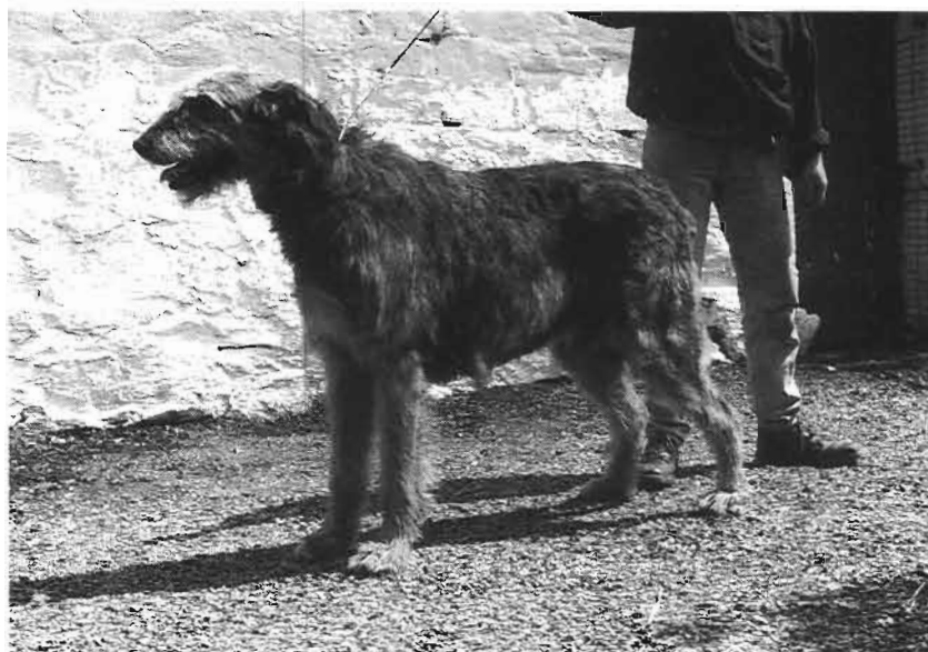
KILLYKEEN MAX Stud Dog Winner 1994 Club Show