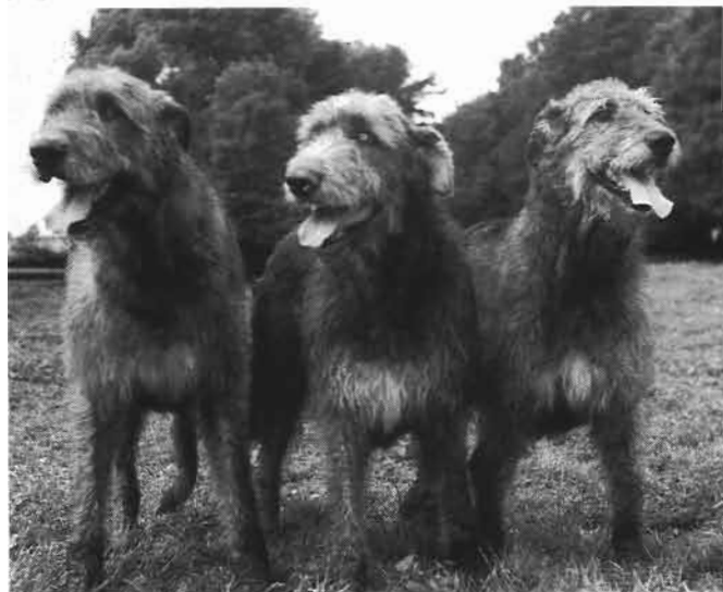
The Next Generation - OWENMORE OSPREY - 10 Months By: Keereen The Conqueror Ex: Ch Owenmore Kestrel