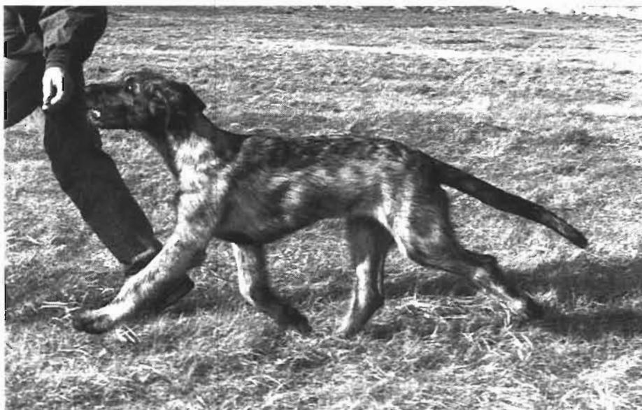
Knocknarea Groi (Oskar x Eilis) at three months

1993 saw the arrival of our long awaited G litter out of Knocknarea Eilis by Beamabui Irial ("Oskar"). Knocknarea Groi and Grace had their debut at the 1994 Club Show where they won their Minor Puppy Classes. Apart from that date we did not show in '94.