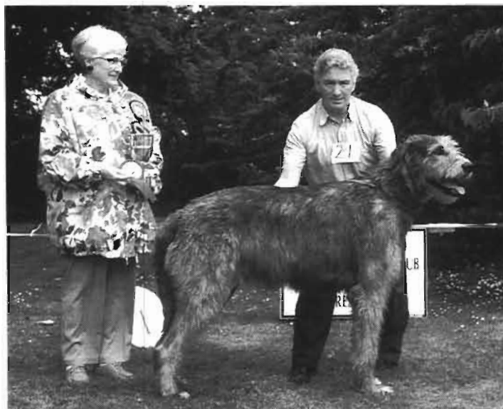
Tolkavalley Athcarne Craigie

Craigie was winner of the Graduate Class at the Irish Wolfhound Club of Ireland Championship Show 1994