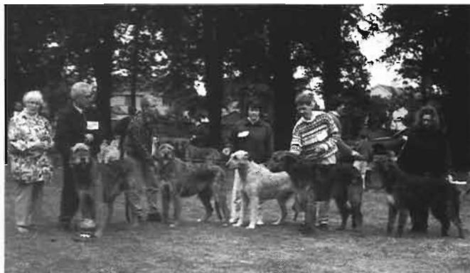
KILLYKEEN MAX - Stud Dog Bowl