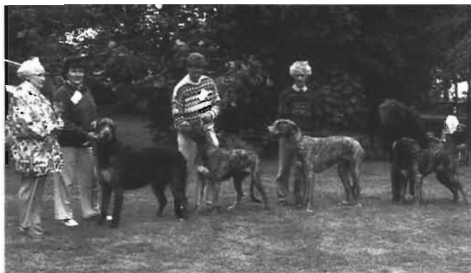
CH OWENMORE KESTREL - Brood Bitch