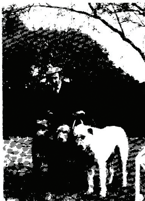
Nutstown Queen & Nutstown King