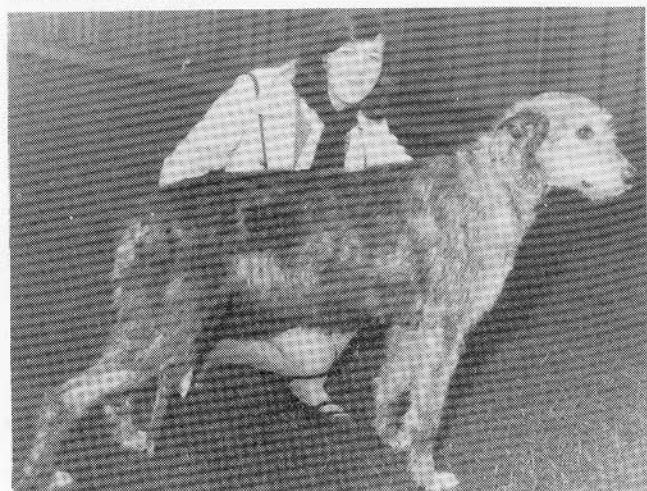
Eileen of Dunamaisie.