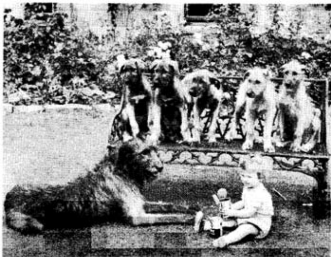
Brenda of Ballygran with her last litter. Showing US Ch. Gort of Dunamaise and his litter mates.