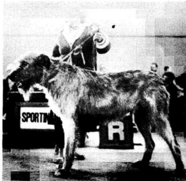
Ch. Diarmuid of Dunamaise.