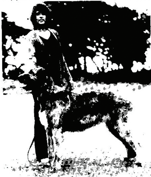
Int. Ch. Tullygirvan Betsy Caolan