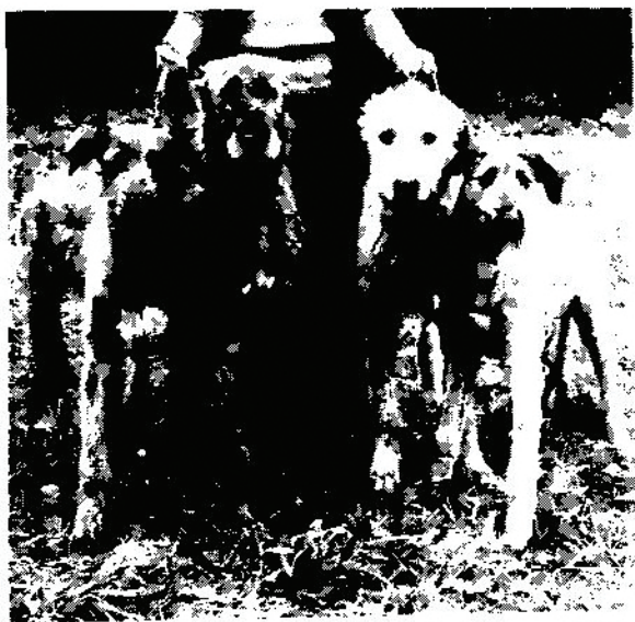
Left to Right: Tullygirvan Brig, Ch. Coleen of Rickenhore, Ballykelly Madigan, Tullygirvan Sinead.