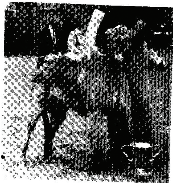
Ch. Coleen of Rickenhore