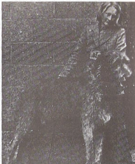
Irish / UK Ch. Artel Ballykelly Sandy