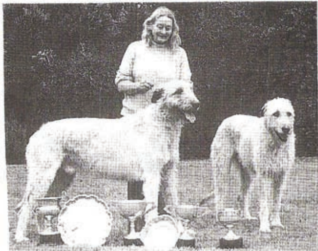
Irish/Nordic Ch. Ballykelly Reamonn

Int (Irish/Nordic) Ch Ballykelly Reamonn, 1970, (Ch Holmehill Torridan x Ch Ballykelly Molly Mulligan) having won Best in Show at Sporting Breeds and Reserve BIS at Irish Breeds while still a yearling, continued his successful career in Norway.