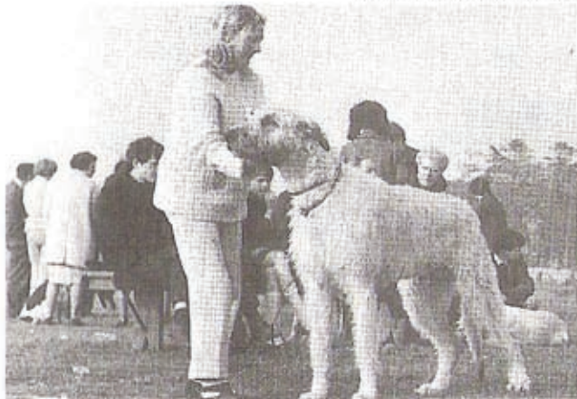
Ch. Holmehill Torridan