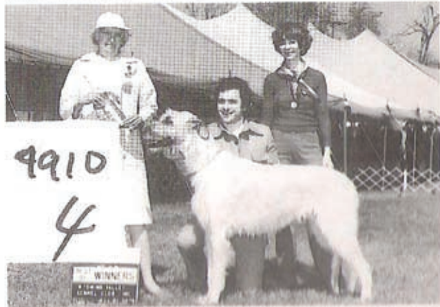
US. Ch. Ballykelly Banshee 9/70