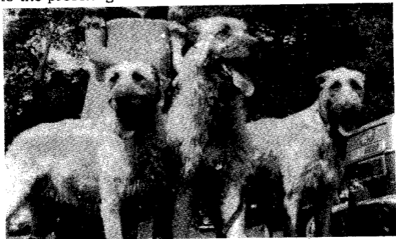
Coill Tomair Maeve, Bernard of Cordoogan, Ch. Athcarne Shiofra.