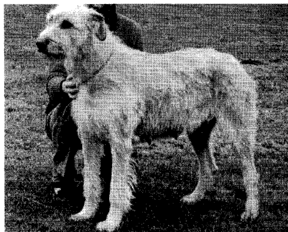
Ch. Coolbreagh Athcarne Clodagh

Fintan's litter sister, Clodagh had some spectacular wins on her way to championship, e.g. Green Star St. Patrick's Day 1980 and Best of Breed the following year. Again in 1981 she took Best of Breed at Swords, our second biggest all-breed show. Clodagh, like the rest of the Athcarnes is always game for the chase. She recently amused everyone at a small informal gathering of hounds by continually scanning the field looking for the non-existent lure.