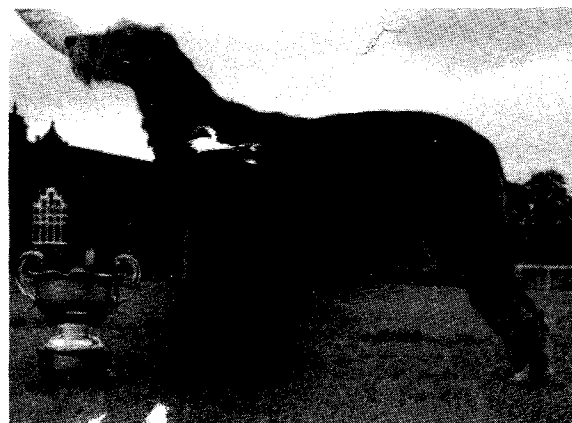
Carrokeel Moon Beam of Nendrum