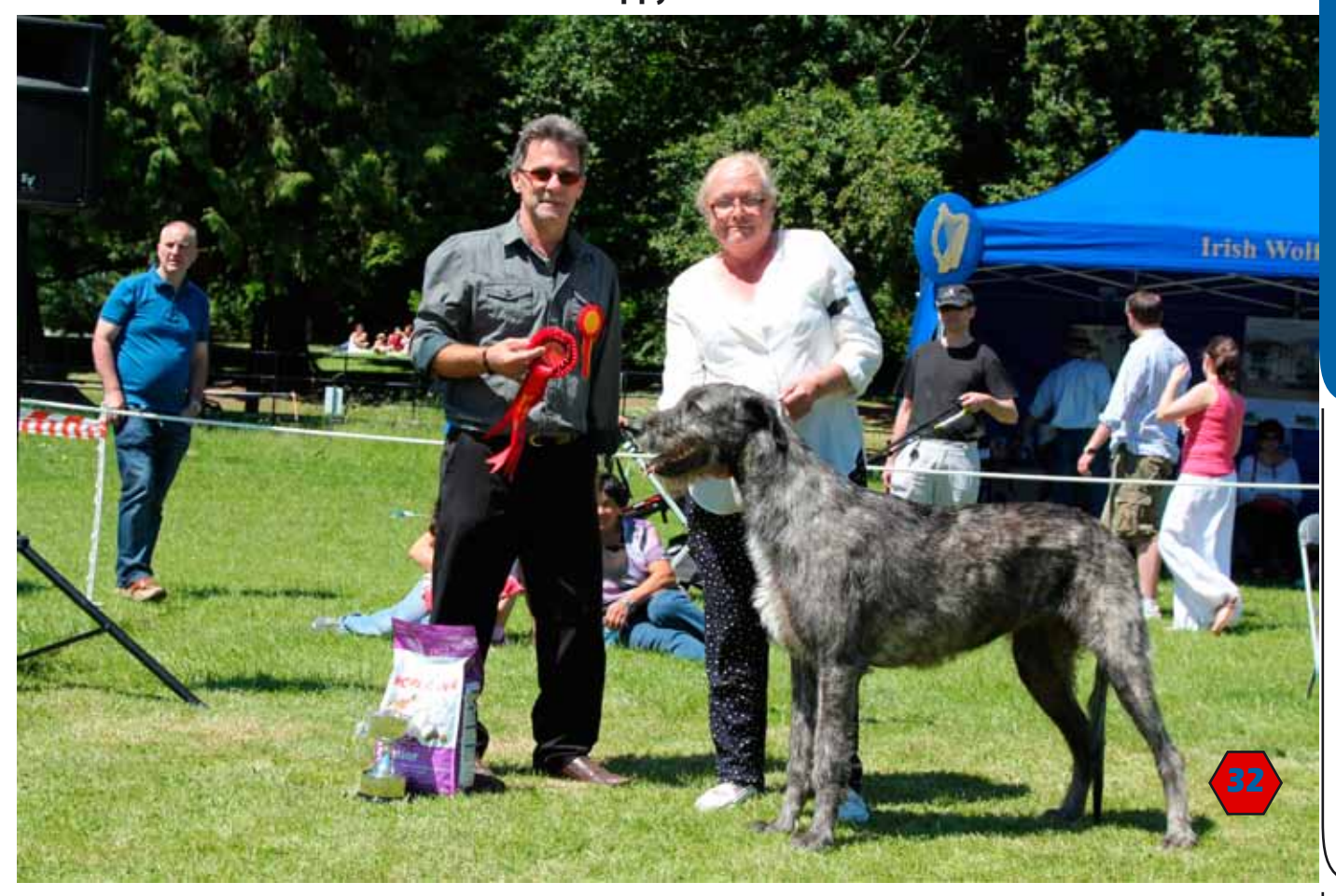
32. 1st Very Promising, Best Puppy in Show 1 year old grey bitch. Very sound mover, good angulation. Already very mature for her age