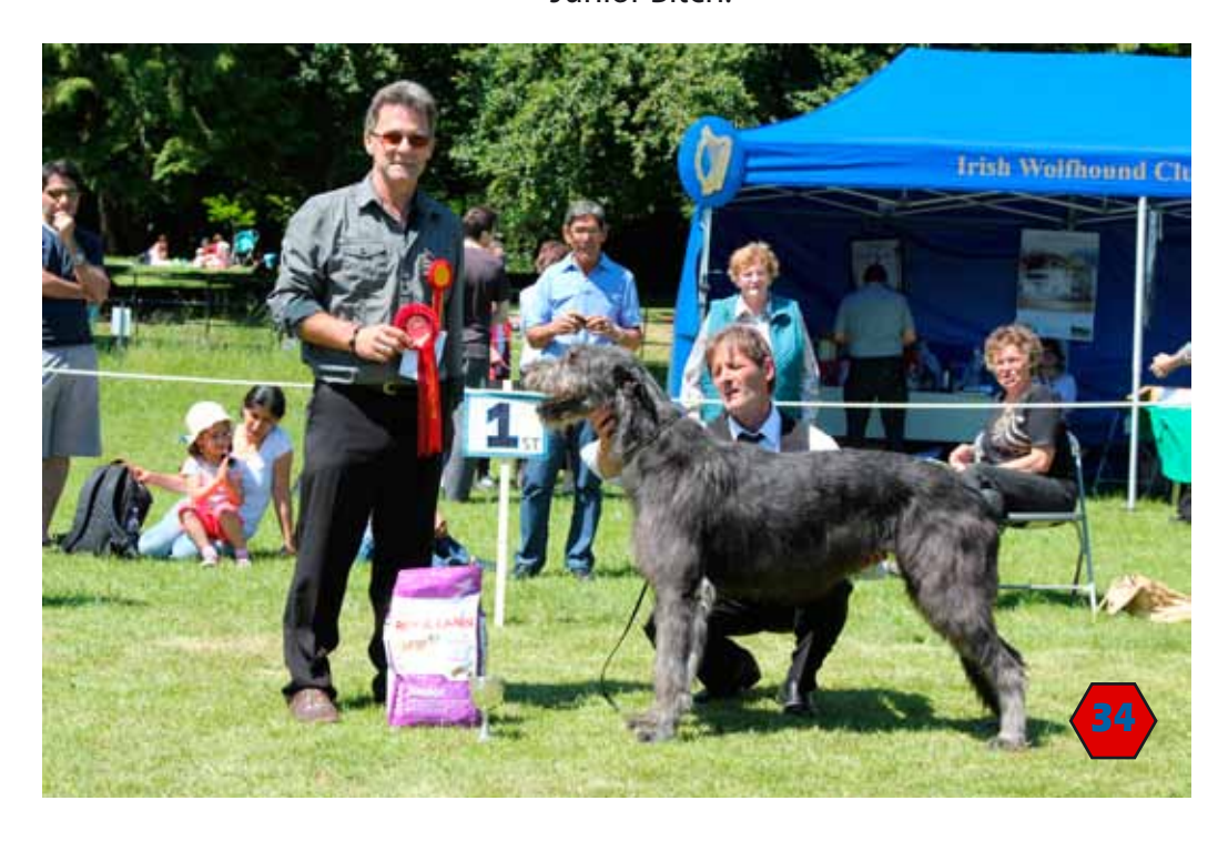
34 1st Excellent. Very high quality bitch. Very good movement once she got launched. Good ground covering. Superb head and expression.