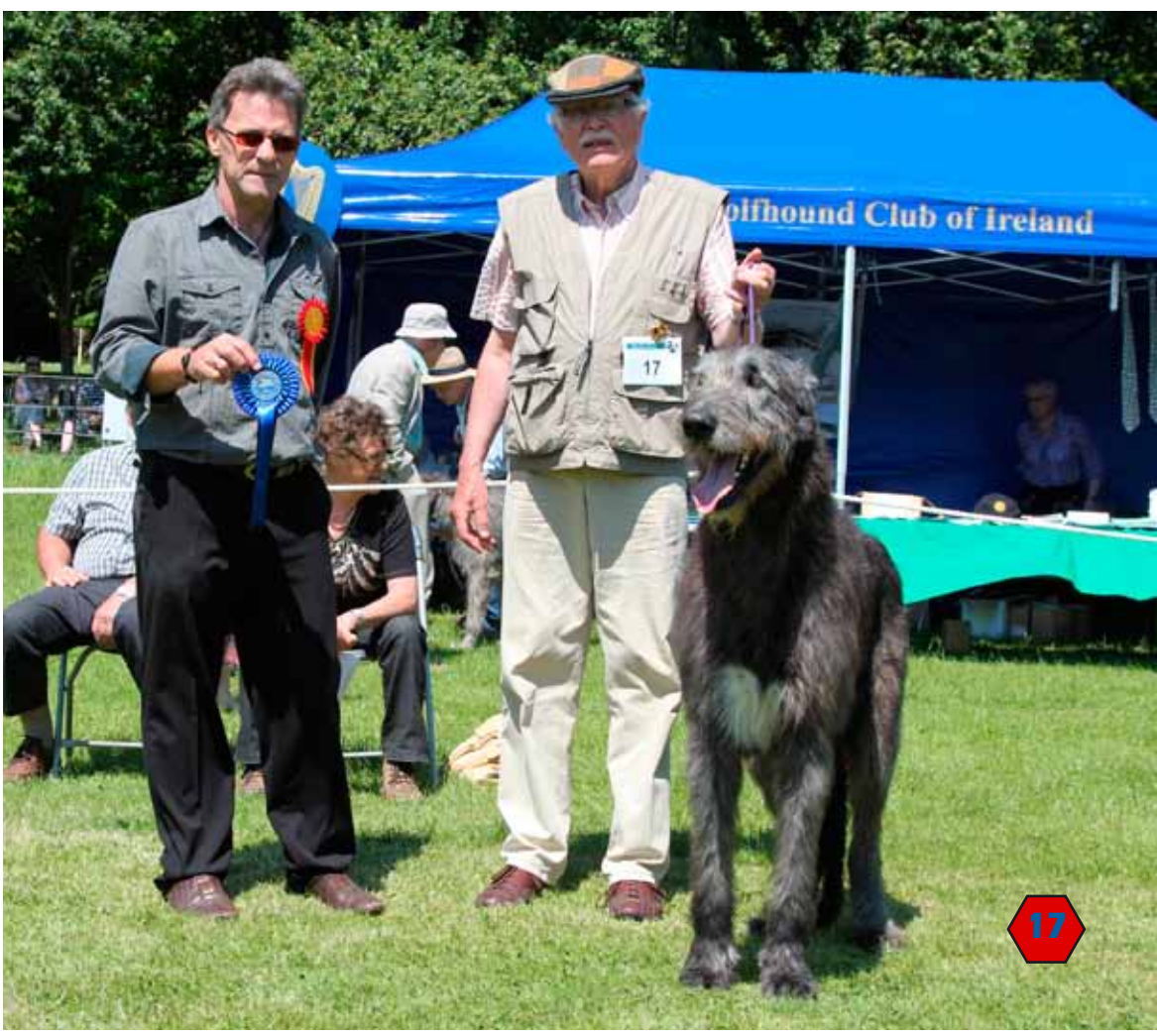
17. 2nd Excellent Superb Dog. Great mover. Needs to be more stable on the rear. Beautiful head

16. 1st Excellent, Green Star Dog and Reserve Best in Show Superb grey Brindle Male. Excellent quality. Great sound mover. Great confirmation