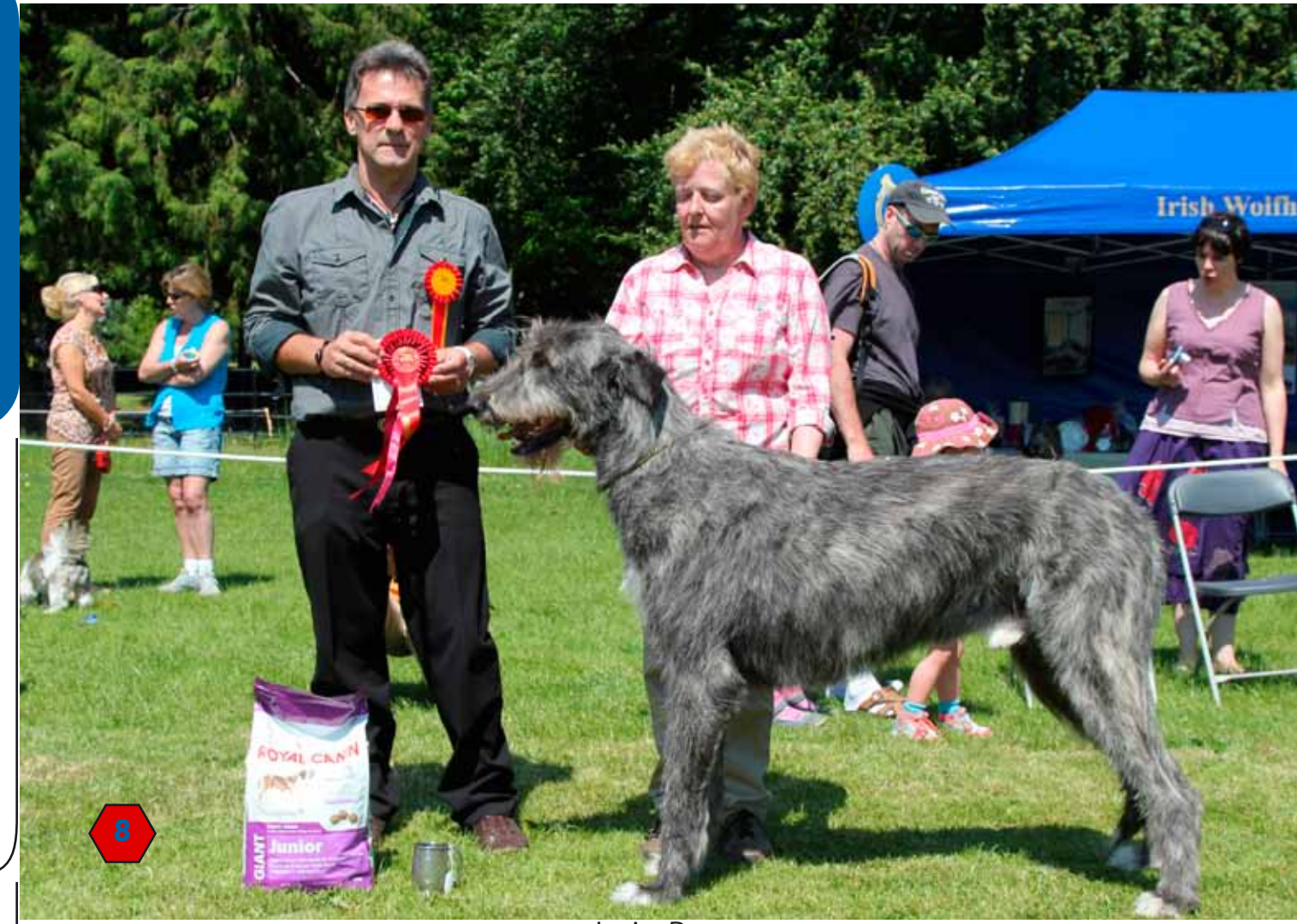
Junior Dog: 8. 1st Excellent

13 Months old grey brindle. Great size and substance. Movement in front a bit wide but the rest ok.