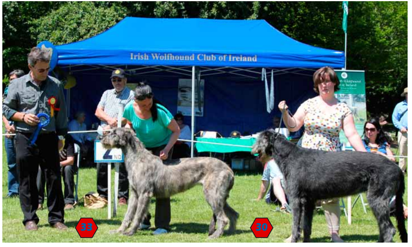
33. 2nd Very Promising Very nice young bitch with superb movement. Little bit long in body. Very beautiful head